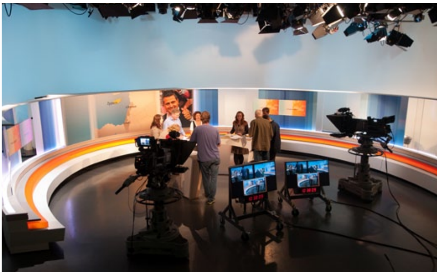
Bayerischer Rundfunk FM1 HD