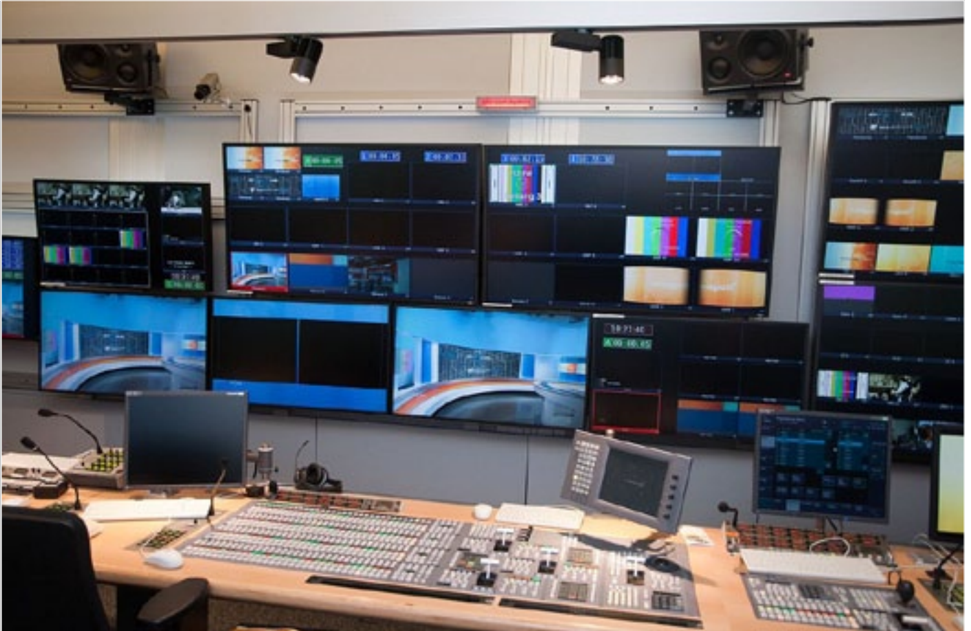
Vision Mixer and Monitor Wall